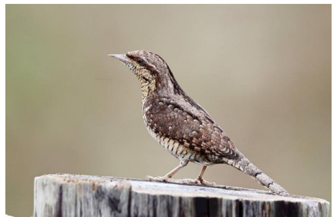
Figure-1. Shows Eurasian Wryneck Jynx torquilla sighted in Belagavi, North Karnataka

The distribution map by Grimmett et al. (1998) shows few isolated records of Eurasian Wryneck in southern India. But the distribution maps by Grimmett et al. (2011) and Kazmierczak (2000) not showing recent sighting records of the said bird in southern India. Whereas, distribution map given by Rasmussen & Anderton (2012) and Arlott (2014) not showing its range in Southern India. Therefore present sighting record of Eurasian Wryneck in southern India is worth of its documentation. Since, there is no published literature of Eurasian Wryneck sighting from Belagavi. It becomes the first photographic sighting record from Belagavi.