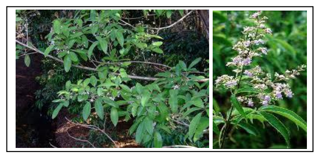
Fig-1. Different parts of selected plant Vitex leucoxylon (L.)

Leaves of the Vitex leucoxylon ( L ). Were collected from the Mulikavanam Dravidian University, Srinivasavanam, Kuppam, Chittoor District, Andhra Pradesh. The plant specimen was botanically identified and authenticated by comparing the herbarium specimen (SVUBH/2012/L-11673) available at Sri Venkateshwara University Thirupathi, chittoor District, Andhra Pradesh.