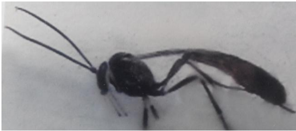
Fig. 4. Charops charukeshi adult female