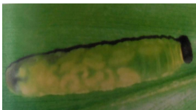
Fig-1. P. mathias containing braconid larvae in body