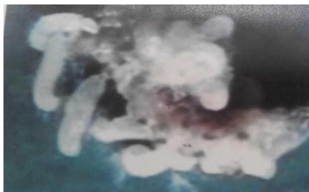
Fig. 3. Dolicogenidea mythimna adults