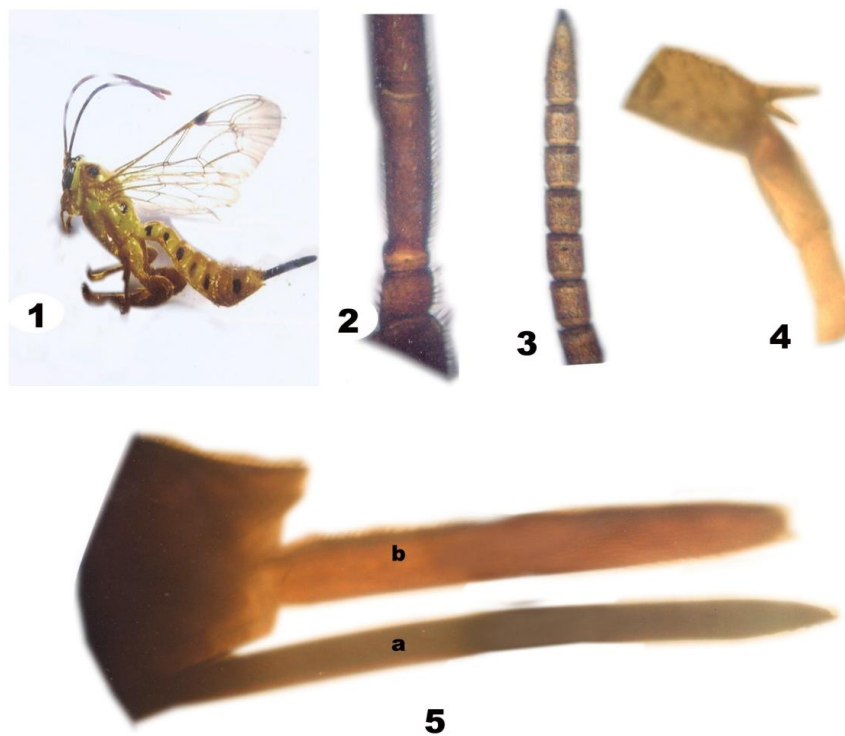
Figure-1. Adult female; Figure-2 Basala antennal segments; Figure-3. Antenna terminal segments; Figure-4. Hind tibial spurs; Figure-5a. Ovipositor; Figure-5b. Ovipositor sheath.