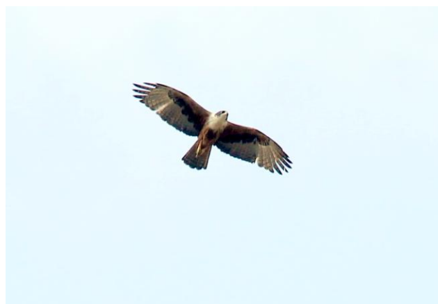
Figure-2. First sighted an Individual Rufous-bellied Eagle, Hieraaetus kienerii flying on the left side of the Kanger River.

The individual was observed gliding and soaring on flight above the canopy of the forest on first encounter event. While on second encounter event the individual perched on the tree after a short flight and turned around. The head and upper part seemed black, flight feathers black-brownish, chin, throat and upper breast pure white streaked black on breast and sides of neck. Legs and feet were yellow as observed in the field and confirmed from photographs and the reference (Naoroji 2011 and Grimmert et al. 2011).