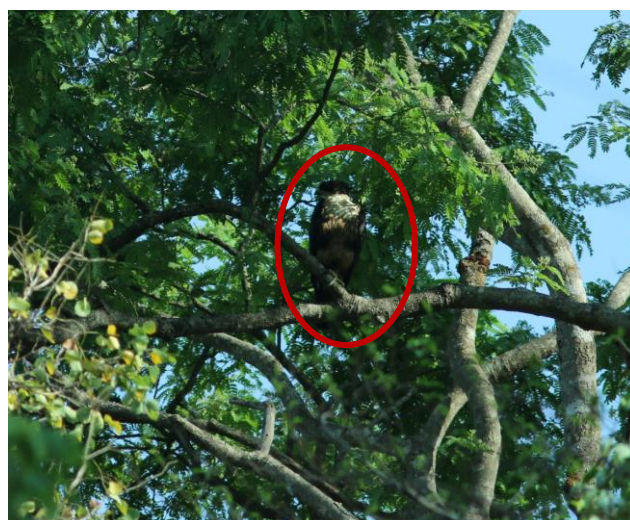
Figure-2. Second sighted picture of Rufous-bellied Eagle, Hieraaetus kienerii perched on the branch of a tall tree

The individual was observed gliding and soaring on flight above the canopy of the forest on first encounter event. While on second encounter event the individual perched on the tree after a short flight and turned around. The head and upper part seemed black, flight feathers black-brownish, chin, throat and upper breast pure white streaked black on breast and sides of neck. Legs and feet were yellow as observed in the field and confirmed from photographs and the reference (Naoroji 2011 and Grimmert et al. 2011).