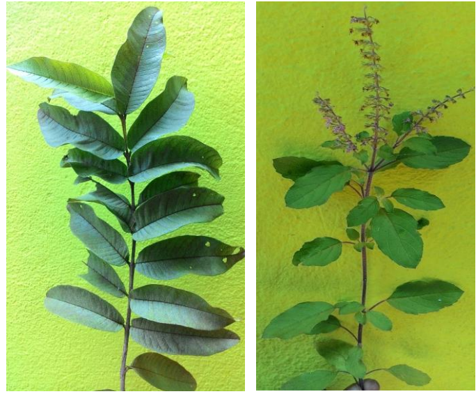
Fig-6. O. sanctum twig