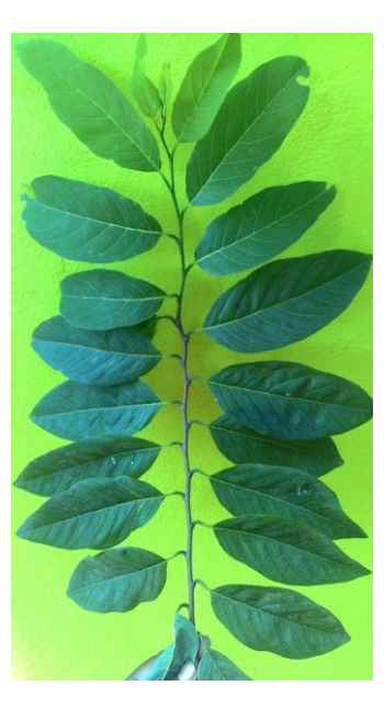
Fig-7: P. guajava twig