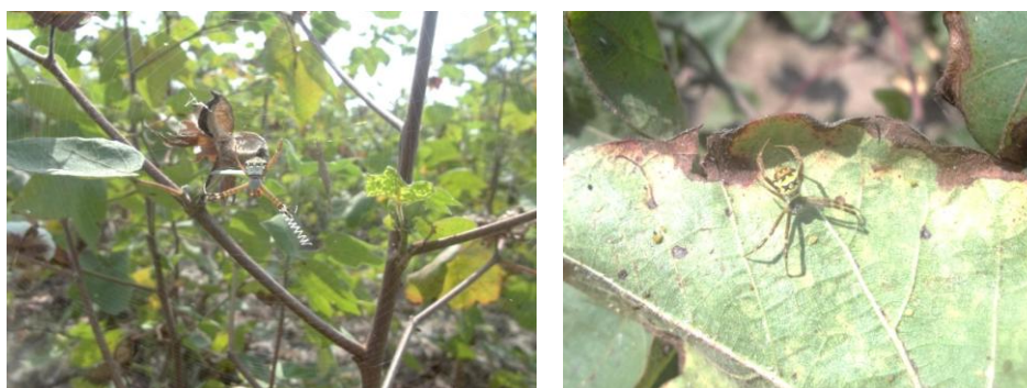
Figure-4: Arjiop anasuja (Writing spider) in Bt-cotton and Non Bt-cotton fields