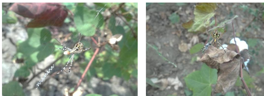
Figure-5: Arjiopeluchella (Signature spider) in Bt-cotton and Non Bt-cotton fields

The predator Arjiopeluchella was observed in 12 th week in Bt-cotton and 11 th week in Non Bt-cotton. Maximum Arjiopeluchella were recorded 28 th week (January) in Bt-cotton and Non Bt-cotton during 2011-2012. The Arjiopeluchella was observed in 13 th week of Bt-cotton and 11 th week of Non Bt-cotton. It's gradually reached at maximum in 29 th week of crop (January) in Bt and Non Bt-cotton during 2012-2013. The Arjiopeluchella was higher in Non Bt-cotton compared to the Bt-cotton ( 7.2 \pm 0.96 , 5.80 \pm 0.73 ) and ( 6.25 \pm 0.25 , 4.5 \pm 0.64 ), during 2011-2012 and 2012-2013 respectively (Table-2 & 3) and (Figure-5).