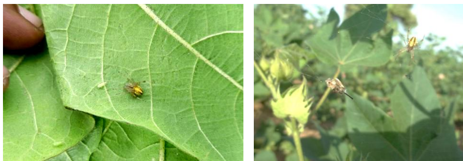
Figure-3: Areneusspp (Garden Spider) in Bt-cotton and Non Bt-cotton fields