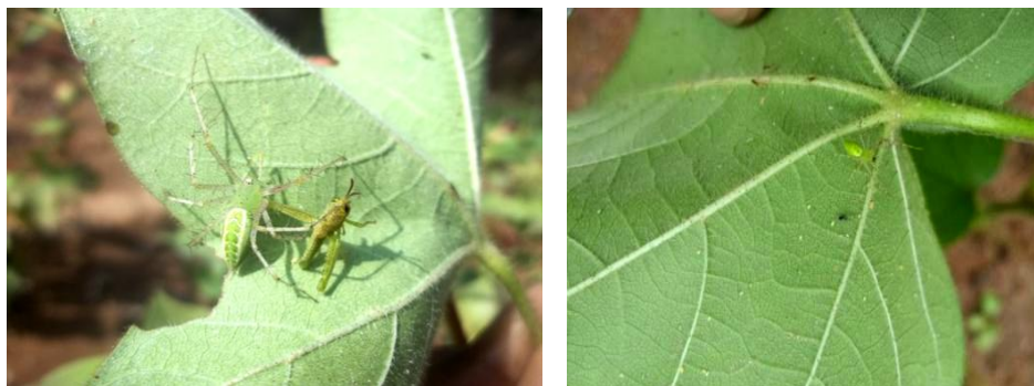
Figure-1: Peucetiavirdans (Green lynx spider) in Bt-cotton and Non Bt-cotton fields