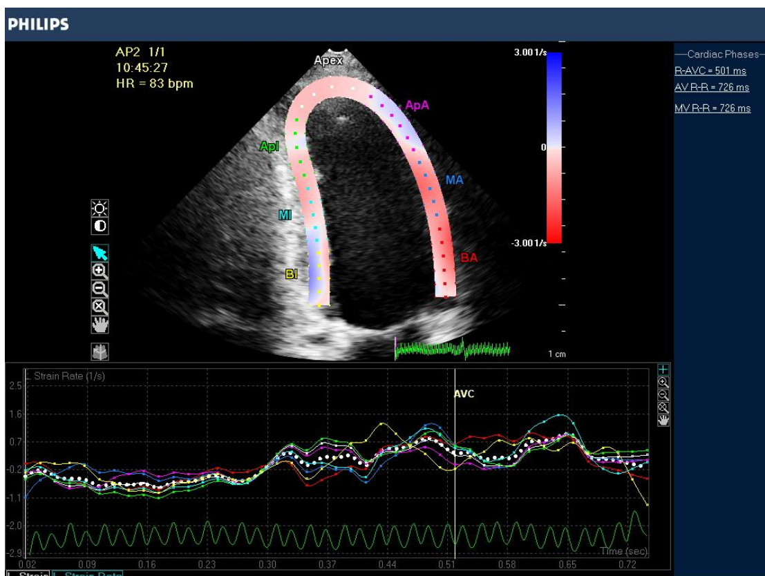
Figure-1. Apical 2 chamber view demonstrate diastolic strain rate in hypertensive patient without LVH

Data were fed to the computer and analyzed using