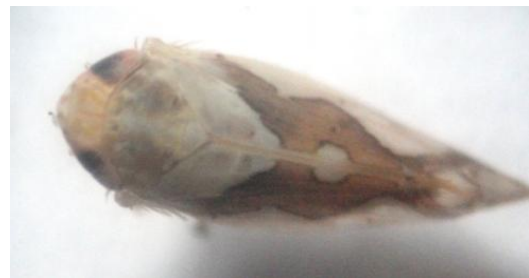
Figure-5. Maiestas dorsalis