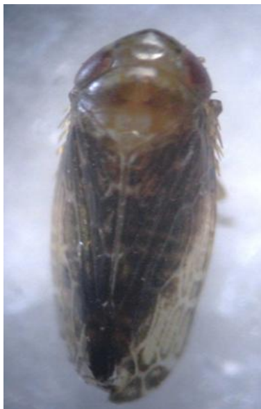
Figure-4. Osbernellus limosus