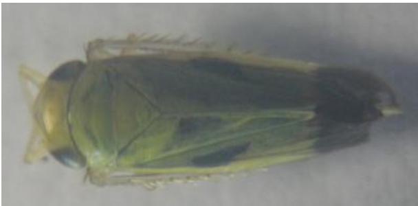
Figure-2. Nephrotettix virescens

Most of the flowering bodies dropped down and sticky substances were associated with the crop. Jassid diversity was relatively more associated with paddy crops. Probably due to mono and continues culture of the crop from Kolhapur region. Many species of Jassids attracted towards the light. Hence, they have been