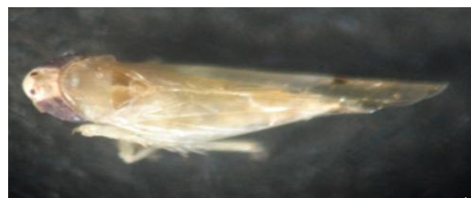
Figure-6. Amrasca biguttula biguttula