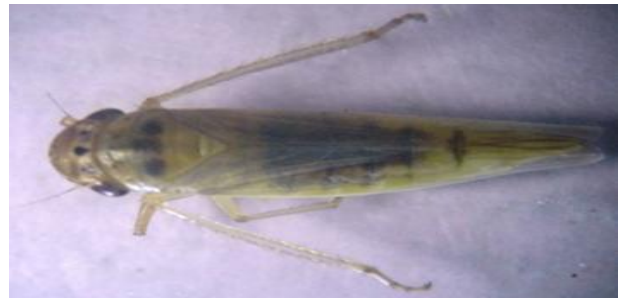
Figure-3. Cofana unimaculata